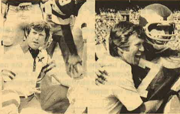
Vermeil in the Trenches.